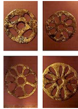
Picture 7. Ivory Sun-disks from the Sungir grave.