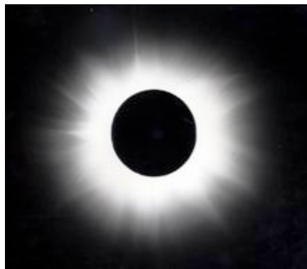
Picture 9. Solar eclipse.

With the parallel of the uplifting intelligence and the life-giving Sun comes the realization that the intellect has to organize mankind into a unified world, just as the light of the awakened consciousness organizes our waking consciousness into a unified state of consciousness, and as the Sunshine organizes the day into a unified world. 14 And out of this, some more deductions emerge. First of all: the first state-building people of mankind were the Hun-Magyar people with the Sun religion. Secondly: by necessity the first state must have been a Kingship, since it must have arisen through the ideal of Kingship. Thirdly: the first Kingship must have been a Sun-Kingship, because it came about through the understanding of the Sun's life-giving, uplifting manifestation (GKE-GA, 2006, 82-98). Fourthly: the Royal insignia had to originate from the Sun. Only one creation has a crown visible to all mankind: the Sun. The Sun's crown is the natural royal insignia.