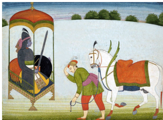
Kalki Avatar Punjab Hills, Guler, c. 1765.

Kalki was described by Guru Gobind Singh in Sri Dasam Granth . Kalki is also mentioned in the oral traditions of Guru Gobind Singh known as the sau sakhis, and possibly the Sarbloh Granth. He is foretold to return on horseback with sword, manifesting himself at the village Sambhal and sounding his trumpet before fighting the wicked.