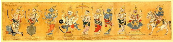
Dashavatara: (from left) Matsya, Kurma, Varaha, Narasimha, Vamana, Parashurama, Rama, Krishna, Buddha and Kalki.