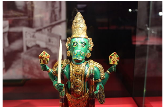
Kalki as Vajimukha (horse-faced).

The Padma Purana describes that Kalki will end the age of Kali and kill all mlecchas. He will gather all brahmanas